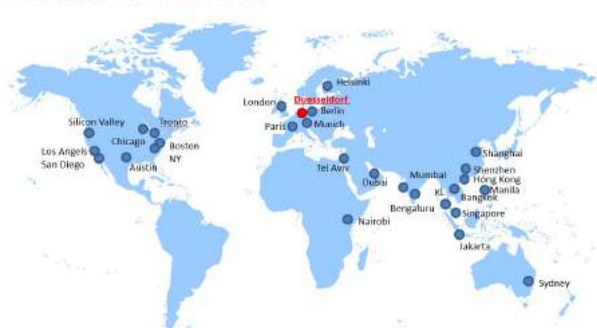
Global Acceleration Hub [29 Worldwide as of April 2021]

Our successful cooperation with the Japan Desk and JETRO was also recognized at the traditional New Year's reception for the local Japanese business community. https://neujahrsgruss-japan